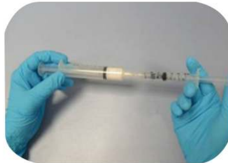
4. The liquid is transferred into the syringe with the powder in order to mix the two components