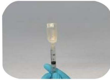
2. Water dose sampling