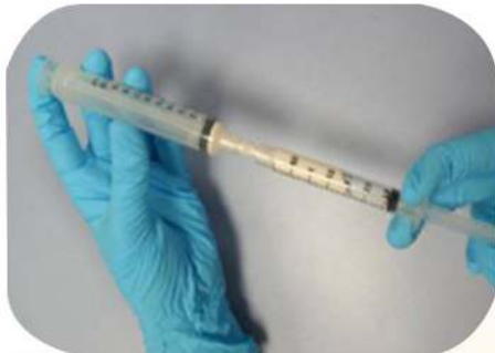
5. The mixture is transferred from one syringe to the other, several times, in order to obtain an homogeneous mixture