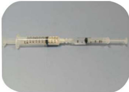
3. Connection of the two syringes (one containing water & the other one containing powder)